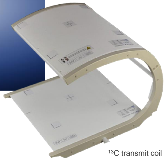
^{13}\text{C} transmit coil