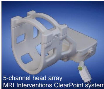
5-channel head array MRI Interventions ClearPoint system

Interventional MRI has become an important tool to guide minimally-invasive procedures. RAPID Biomedical has supported this development with a variety of coil designs for interventional and stimulated studies. Above you find a collection of these designs. Some of these coils are available as a package with the interventional device through our collaborating partners. Others can be ordered at RAPID Biomedical directly.