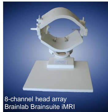
8-channel head array Brainlab Brainsuite iMRI