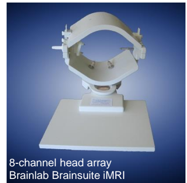
8-channel head array Brainlab Brainsuite iMRI