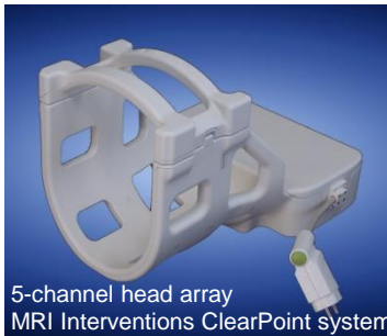
5-channel head array MRI Interventions ClearPoint system

Interventional MRI has become an important tool to guide minimally-invasive procedures. RAPID Biomedical has supported this development with a variety of coil designs for interventional and stimulated studies. Above you find a collection of these designs. Some of these coils are available as a package with the interventional device through our collaborating partners. Others can be ordered at RAPID Biomedical directly.