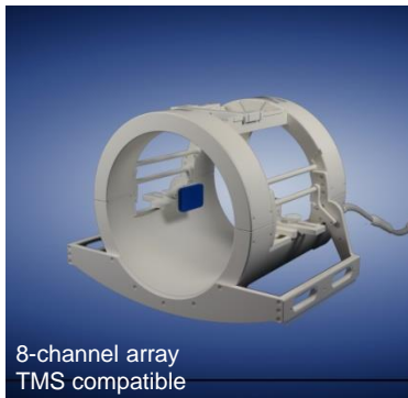
8-channel array TMS compatible