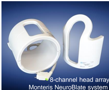
8-channel head array Monteris NeuroBlate system